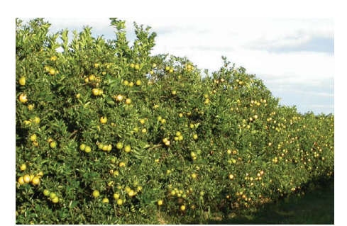
Improved fruit set